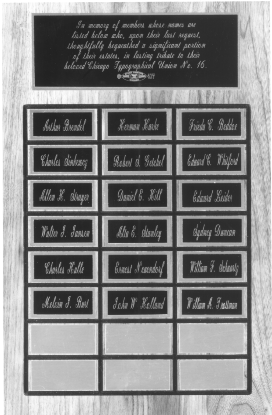
Pictured above is Chicago Typographical Union's Memorial Plaque which honors deceased members who, during the last 35 years, bequeathed to CTU No. 16, a substantial portion of their estates.